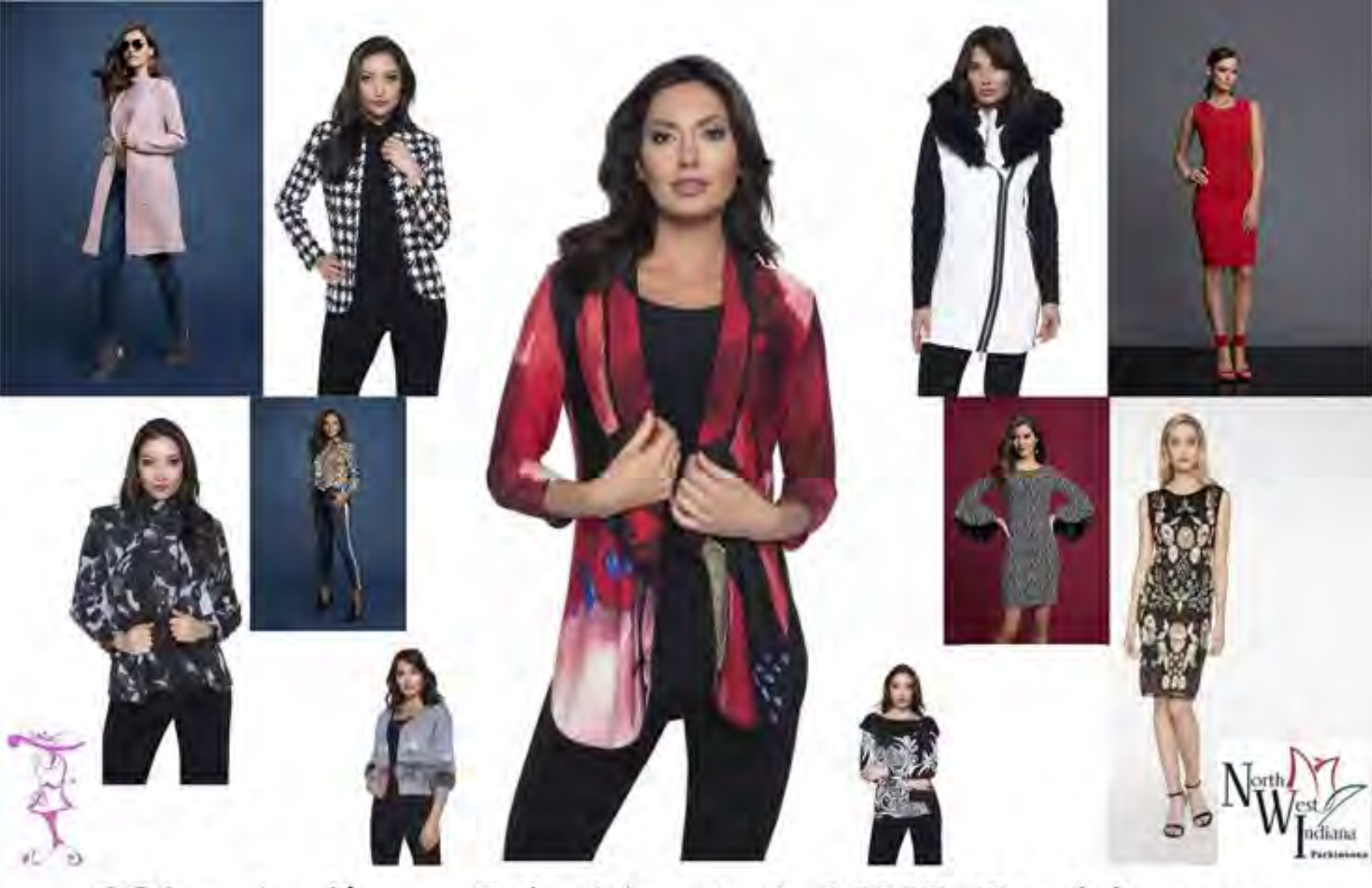
Elizabeth's in Highland & NWI Parkinsons invite you to our 1st Fall Event for 2019 featuring over 200 styles* from: