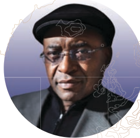
Strive Masiyiwa Founder & Chairman, Econet Group; Philanthropist