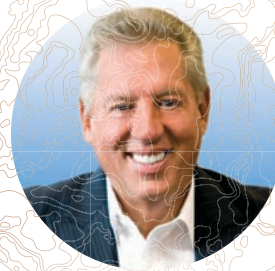
John C. Maxwell Leadership Expert; Bestselling Author; Coach