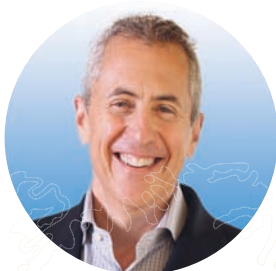
Danny Meyer Restaurateur; TIME Magazine's "100 Most Influential People"