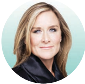
Angela Ahrendts Senior Vice President of Retail, Apple