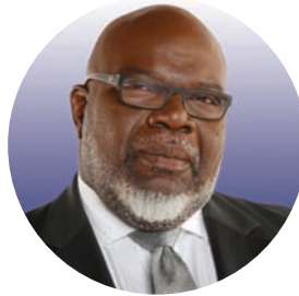
T.D. Jakes Founder and Senior Pastor, The Potter's House