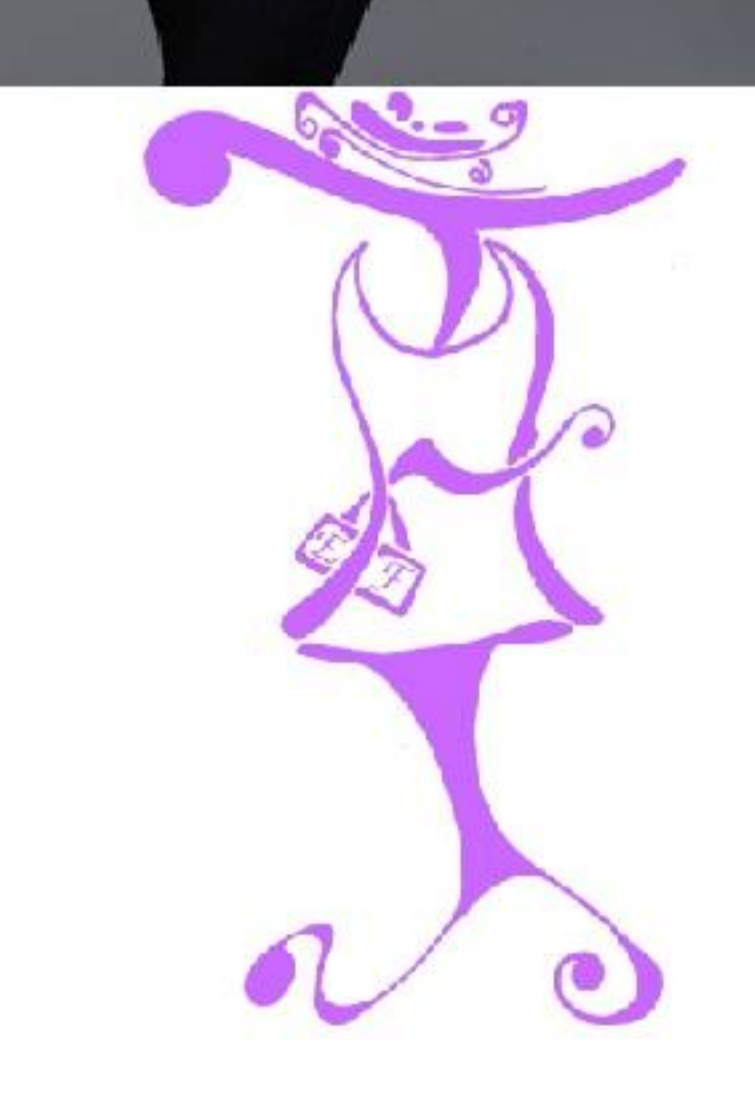
Special Pricing for this Trunk Show. Refreshments will be served.

<u>ALL</u> proceeds from this event and boutique sales fund our local Support Groups, Group Therapy Sessions with Rock Steady Boxing at Fitness Pointe, Dancercise, Yoga & Kick Boxing classes and our 10th Annual Symposium on April 21, 2018,, Call 219-237-2342 for more info.